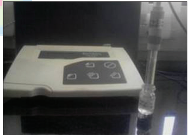
Figure 3: Digital pH meter