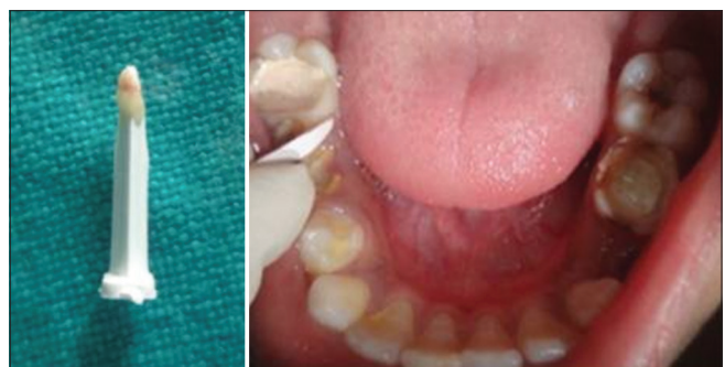
Figure 1: Collection of plaque samples

The procedure was carried out in Clinical Science and Research Development Laboratory. Calibration of pH meter (Eutech Digital pH meter, Switzerland) was done using buffer solutions with pH 4 and 7 (Sensorex, USA), prepared using the buffer capsules, every day before the commencement of experiment. pH was separately evaluated for each time interval, and 1 g of plaque was dissolved in 1–2 ml of distilled water [3] [Figure 2]. The electrodes were cleaned and blotted dry, and tip of the electrode was placed in the plaque suspension [Figure 3]. It was held in position until the readings on the display unit stabilized. The electrode was rinsed with distilled deionized water after each reading to prevent cross-contamination.